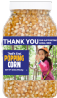
$15 POPPING CORN