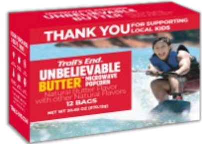
$20 UNBELIEVABLE BUTTER MICROWAVE