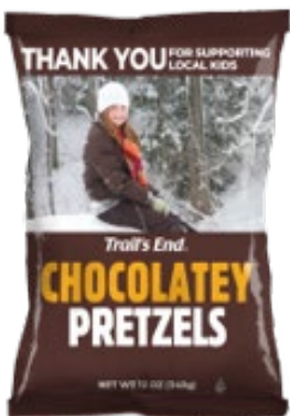
$25 CHOCOLATEY PRETZELS