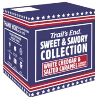
$40 SWEET & SAVORY