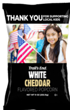
$20 WHITE CHEDDAR