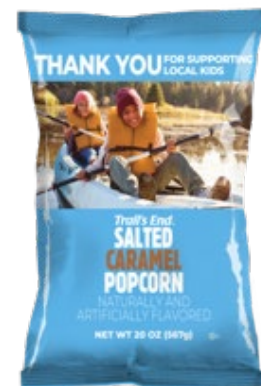
$25 SALTED CARAMEL