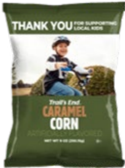
$10 CARAMEL CORN