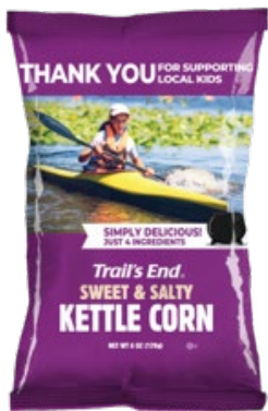
$20 KETTLE CORN